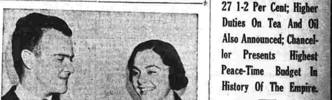
London, April 26.—(AP)—The British government jolted the nation today by boosting the income tax from 25 per cent to 27 1/2 per cent to help pay the costs of the staggering rearmament program.

Sir John Simon, chancellor of the exchequer, in his annual budget speech before a shocked House of Commons, announced the income tax would be raised from five shillings in the pound to five shillings sixpence (from $1.25 to $1.37 1/2 in $5.00).